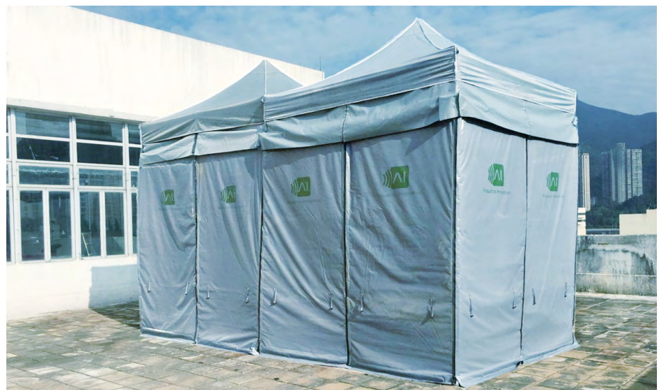
SilentCUBEs seamlessly connected with good gap sealing